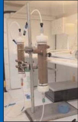
BGS soil samples inside a Whitley VA500 Workstation.