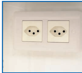
Optional internal country-specific mains power sockets.