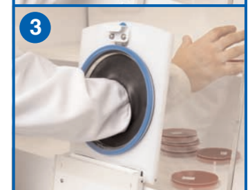
A35 Instant Access Portholes - just three easy steps to use