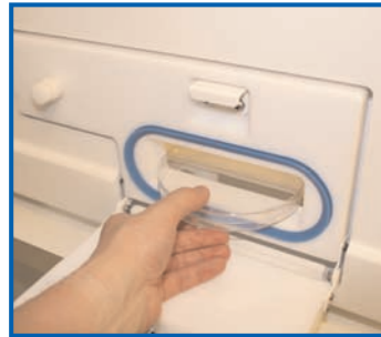
15cm Letterbox - Ideal for introducing individual samples quickly.