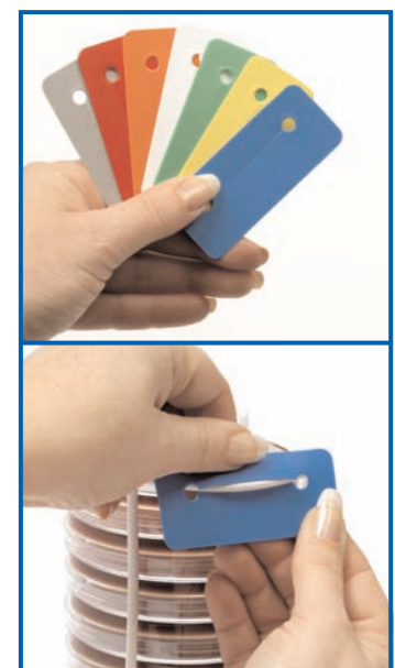
Basket Tag Set