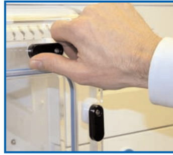
Easily removable front for equipment transfer and thorough cleaning